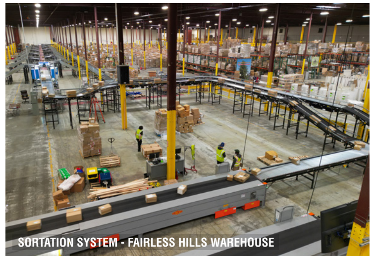
SORTATION SYSTEM - FAIRLESS HILLS WAREHOUSE