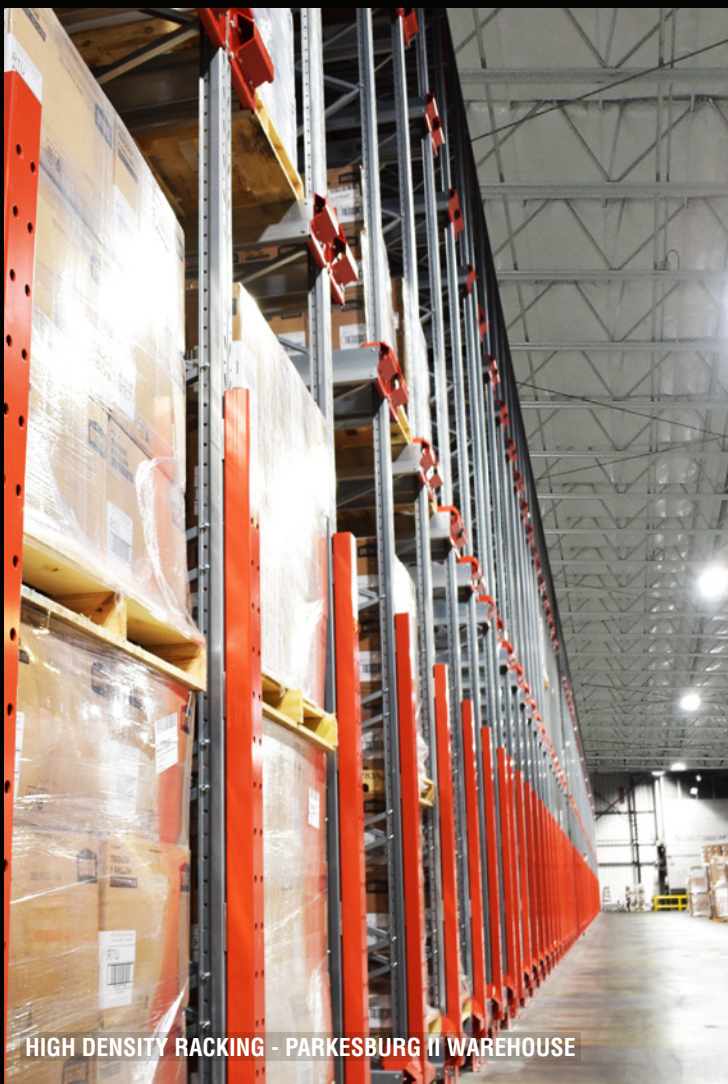
HIGH DENSITY RACKING - PARKESBURG II WAREHOUSE