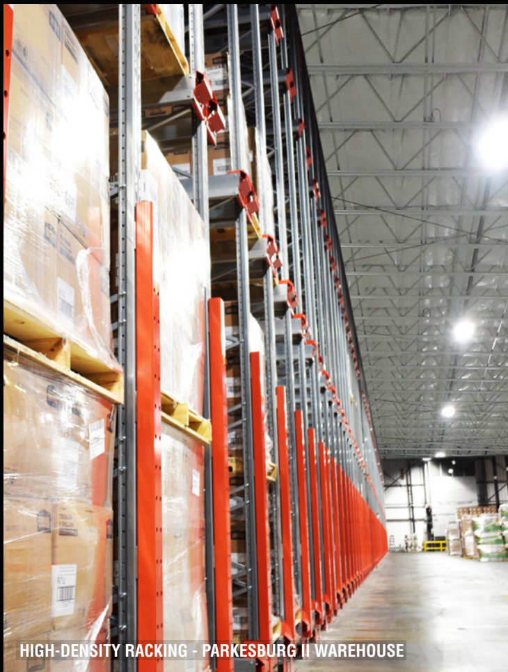
HIGH-DENSITY RACKING - PARKESBURG II WAREHOUSE